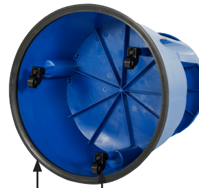
Antislip rubber base. Locking wheel system.