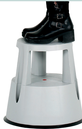
Max. load 330.693 lbs