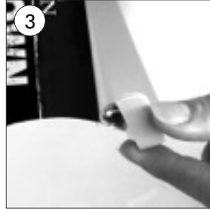
•Close the profile and the endcaps.