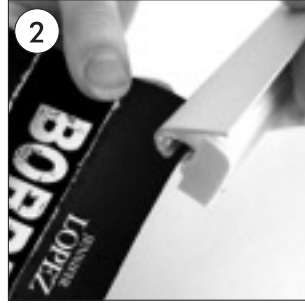
•Open the profile and slide the poster, through the profile.